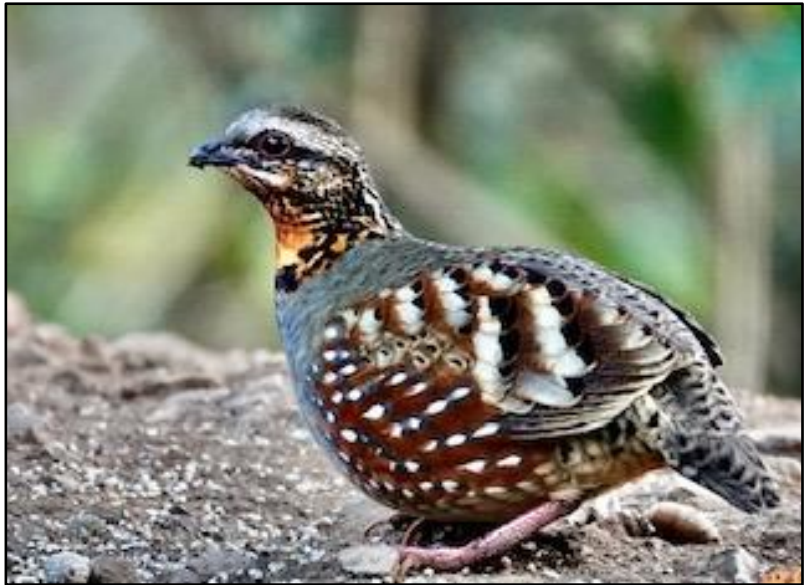
Rufous-throated Partridge

We then made our way to Dholpur and had a great adventure on the Chambal River. We ticked off the elegant Indian Skimmer, Pallas's Gull, Sand Lark, Black-bellied and River Terns, Red-naped Ibis, and Temminck's Stint. Our final destination was the cultural hub Agra and the Taj Mahal. The Taj Mahal was a spectacle to be witnessed in person and the favourite quote of the day was that "The Taj was merely a tear drop on the cheek of time". We finished off in Delhi whilst getting Sarus Crane en route! A fantastic ending to a memorable trip.