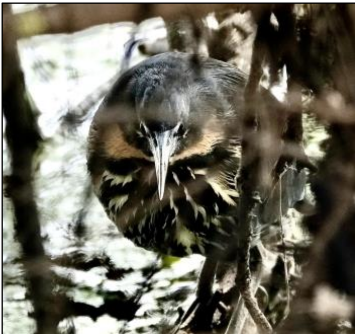
Black Bittern by Stanley Furtak