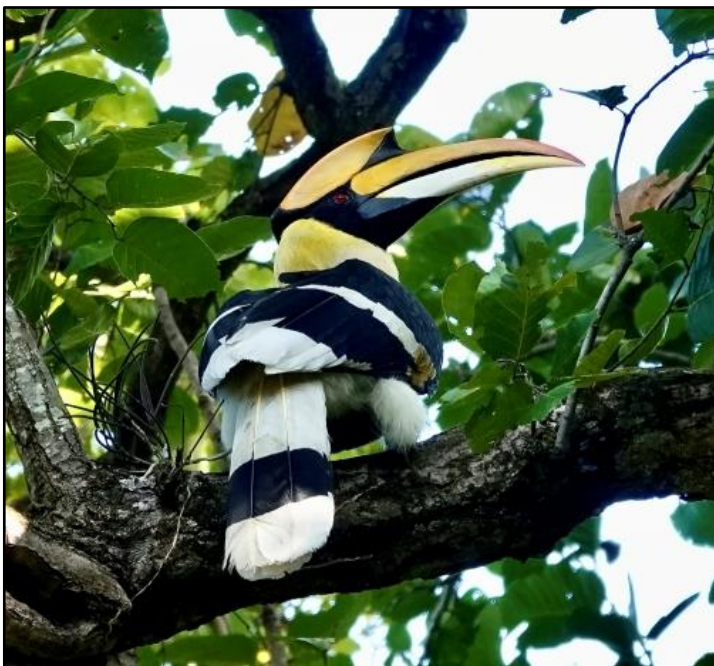
Great Hornbill by Stanley Furtak

We left for the Himalayas and ventured there via train with great looks at the countryside. Upon reaching Sattal, we set straight to work and were rewarded with Tawny Fish Owl, Himalayan Black-lored Tit, Long-billed and Scaly Thrushes! A hide/blind was visited the following day and what a treat this was. We got excellent looks at Grey Treepie, Grey-headed Woodpecker, Plum-headed Parakeet, Rufous-throated Partridge, Kalij Pheasant and Red-billed Leiothrix. The surrounds produced Brown-fronted Woodpecker, Blue-capped, Plumbeous and White-capped Redstarts.