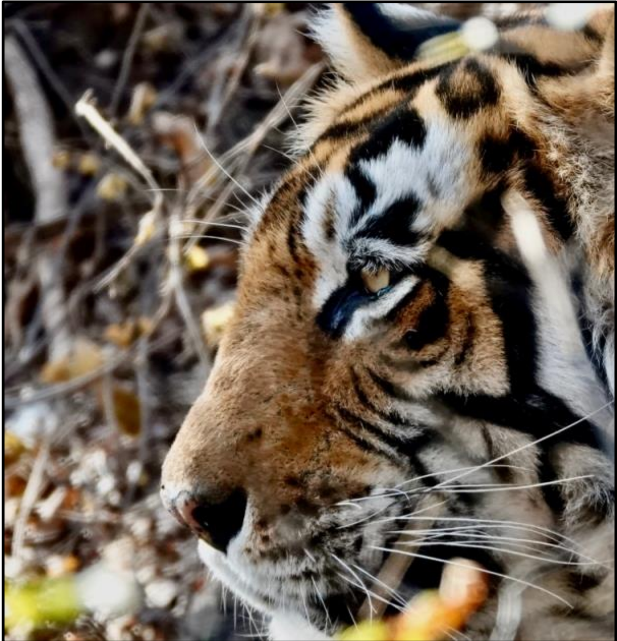
Bengal Tiger